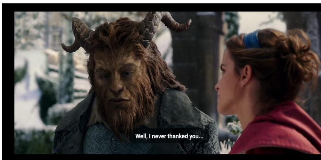
Figure 4. The screenshot when they were sitting in the garden.

After the confrontation with the wolves, where Belle has just helped Beast after he saved her. The atmosphere is tense but begins to soften as they reflect on the events that have transpired.