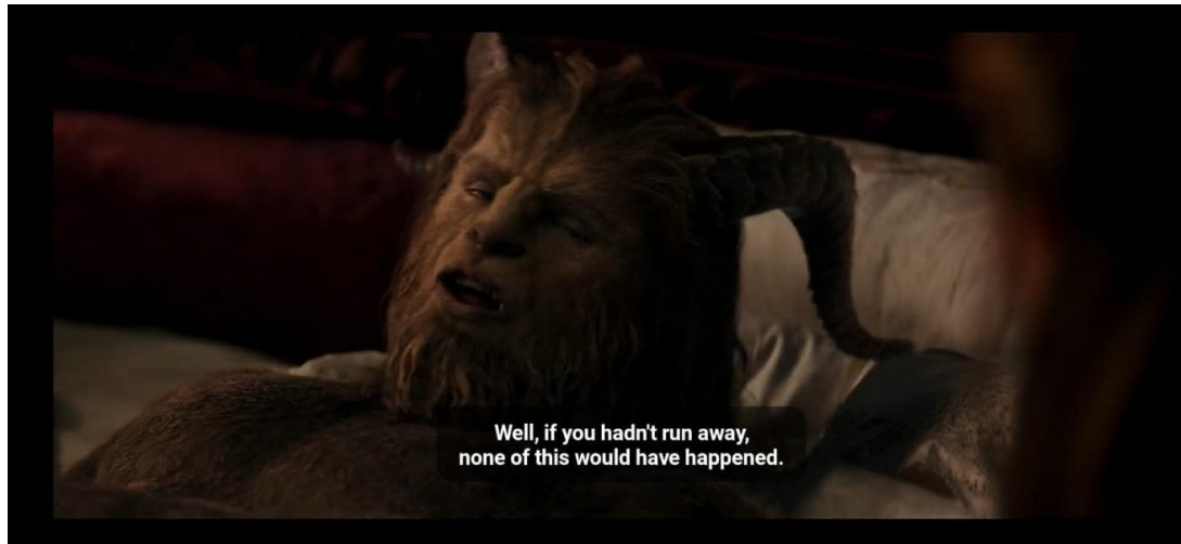
Figure 2. The screenshot When Belle was trying to apply medicine to the Beast's wound.

After Belle runs away from the castle in fear and distress, she encounters the pack of wolves. Beast arrive just in time to save her but end up getting injured in the process.