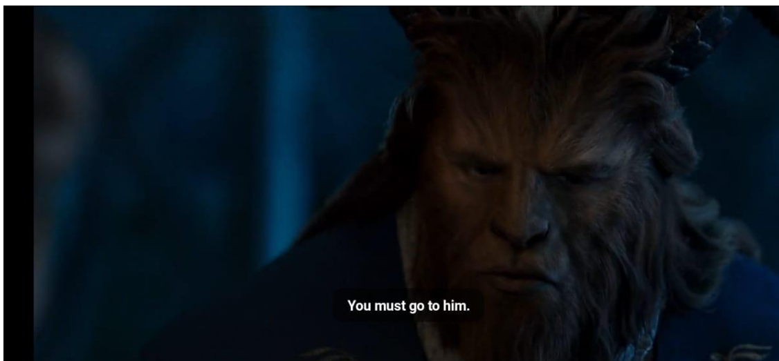
Figure 5. The screenshot when the Beast told Belle to visit her father.

After a magical dance in the castle ballroom, the Beast's sees Belle's longing for her father and takes her to the west wing. Using her magic mirror, Belle sees Maurice in danger, chased by an angry mob in the village. Desperate to help but not knowing how, Belle is stunned when Beast tells her to find her father and bring the mirror so they can stay connected.