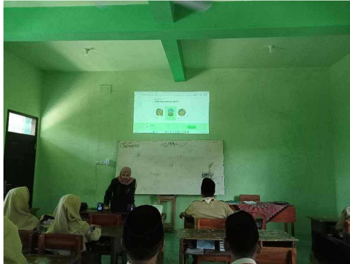
Figure 1. The Utilization of Duolingo Application in Class

The post-test was held on January 18, 2024. Twenty-six students in the seventh grade at MTS Daarul Ulum Margomulyo Blitar completed a post-test covering 25 items that were identical to those they had completed on the pre-test. The post-test's questions, however, were arranged differently and were more randomly distributed than those in the pre-test. The exam lasted for ninety minutes, like before. But in contrast to pre-tests, students had much greater confidence. Almost none of the students asked the test-related questions to complete the exam or after the treatment. The researcher instructed the students to turn in their worksheets at the front desk after the allotted time ran out. The post-test average of 83.65 indicates that all 26 students completed the test with ease. After that, the researchers used SPSS25 to evaluate it. The goal of the analysis was to calculate and compare the pretest and post-test significance with the needed significance (0.05) in order to ascertain the t-test result and whether it falls on the Alternative Hypothesis ( H_a ) or Null Hypothesis ( H_o ). Based on the calculated p-value ( \text{sig } 2 < 0.001 ) and the t-distribution graph, the difference in vocabulary comprehension between the pre-test and post-test scores for students using Duolingo is statistically significant. This provides strong evidence that Duolingo effectively improved the vocabulary comprehension of procedure texts among seventh-grade students at MTS Daarul Ulum Margomulyo.